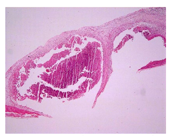
Figure 2. Presence of larvae in nodule of large intestinal mucosal layer (parasitic gastroenteritis).

Klebsiella pneumoniae and Escherichia coli were isolated from all organs. Diagnosis of nodular worm infestation based on gross pathology and histopathology found multiple whitish nodules and transient inflammatory nodules with parasitic larvae on the large intestinal mucosal layer. The